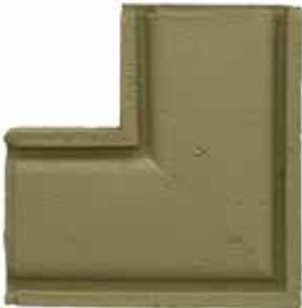
Window Trim Corner