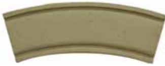
Window Trim Arch 2