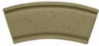
Window Trim Arch 1