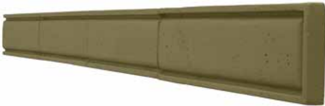
Window Trim Straight - Long View