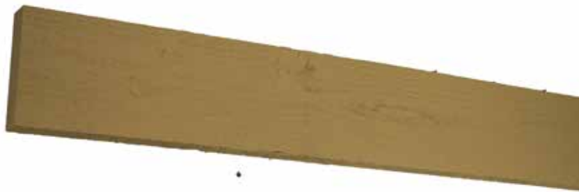
2" x 8" Flat Stock