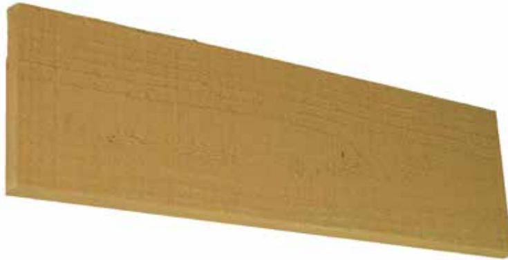
1" x 10" Flat Stock

FS-1-12-(LF)-RS Flat Stock 1" x 12" x (Lin Ft) Rough Sawn